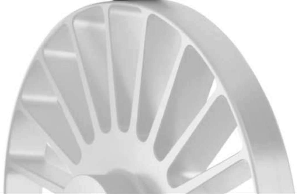
Impeller from the Fristam FZ