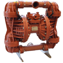
Red Series - P50BR FRAS (Fire Retardant Antistatic) Nylon Body- Hytrel Elastomers- For Explosive Environment- ATEX M1 Rating

Other materials are available to suit your specific application