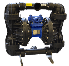
Ebony Series - P50BE Noryl Body- Corrosive Resistant Internals- For Acids And Other Hazardous Liquids, ATEX M2 Rating